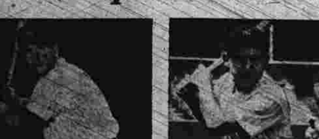
MIKEY MANTLE YOGI BERRA

Brooklyn Oct. 2 (AP)—The well-rested New York Yankees ruled a 7-1 victory over the Brooklyn Dodgers in the first game of the 1956 World Series, which starts tomorrow at Ebbets Field.