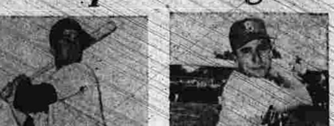
DUKE SNIDER PEE WEE REESE

Brooklyn pitcher until after the work-out today or perhaps until just before game time tomorrow.