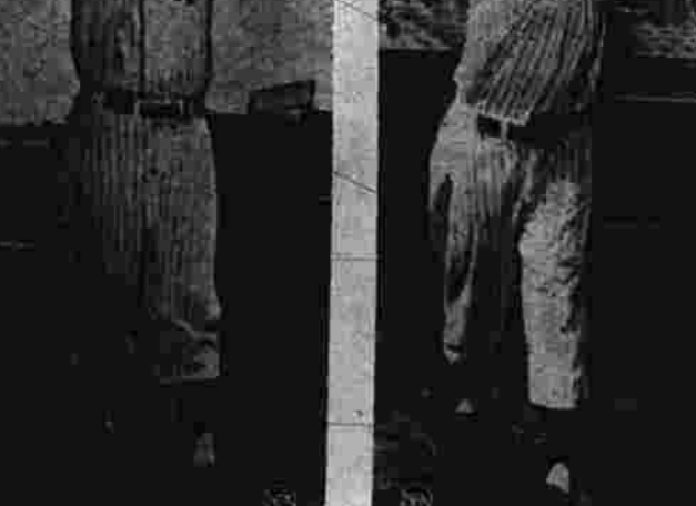
WILLEY FORD BILL SKOWRON

Brooklyn Oct. 2 (AP)—The well-rested New York Yankees ruled a 7-1 victory over the Brooklyn Dodgers in the first game of the 1956 World Series, which starts tomorrow at Ebbets Field.