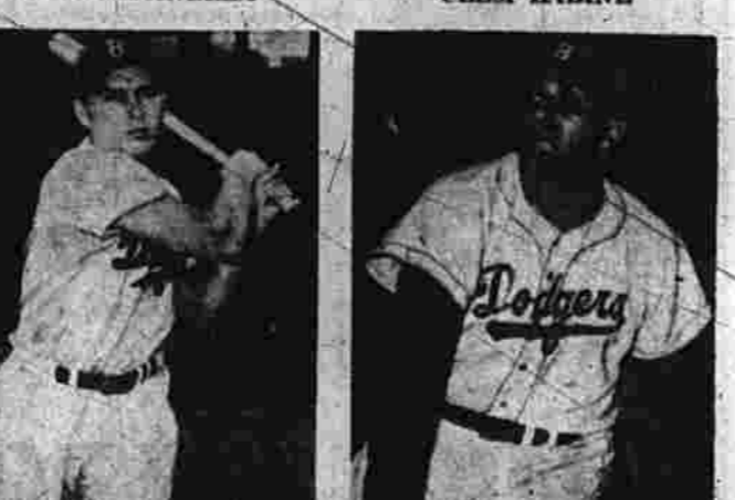
GIL HODGES DON NEWCOMBE

Brooklyn pitcher until after the work-out today or perhaps until just before game time tomorrow.