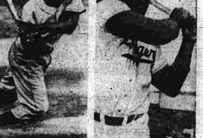
JIM GILLIAM JACKIE ROBINSON

Brooklyn pitcher until after the work-out today or perhaps until just before game time tomorrow.